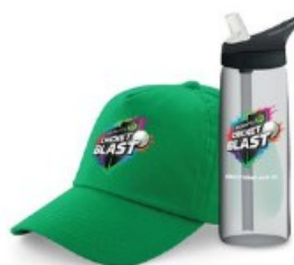
MASTER BLASTERS KIT