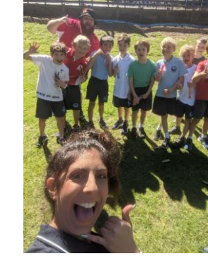
Girls 10 Yrs